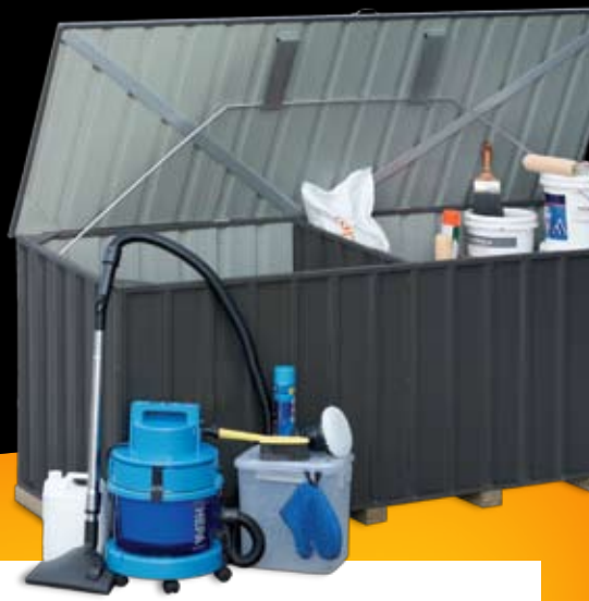
Gearbox 1400 shown in Ironsand

*Colours shown are reproduced as accurately as the limitations of the printing process allows. Please ask your retailer to see a genuine coloursteel colour chart.