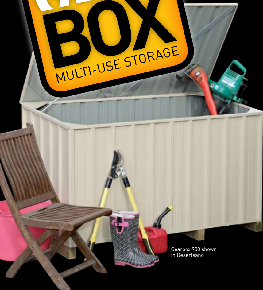
Gearbox 900 shown in Desertsand